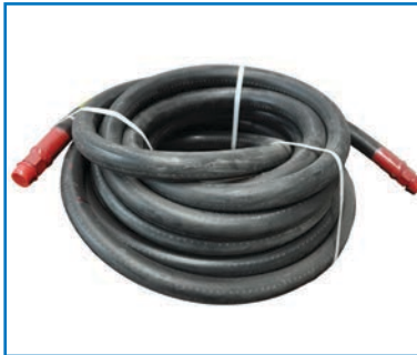
Product: HS50x1/2 or HS50x3/4 or HS50x1 Description: 50' by 1/2", 3/4" or 1" Gas Hose (Any Combination Specific To Sizing) Propane or natural gas