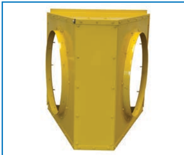
Product: R65502.024 Description: Bullnose Transition With Two Collars for 20" Duct