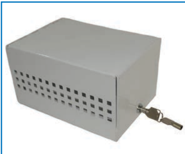
Product: R87800.041 Description: Thermostat Lock Box