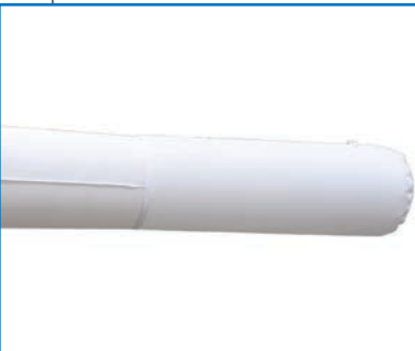
Product: 250.0028.103 (28" x 25') 250.0028.104 (28" x 50') 250.0028.105 (28" x 100') Description: 28" x 150' Maximum Length White Zippered Fabric Duct. Longer runs can be used with increased HP - contact your TA rep for calculations