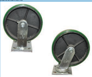
Product: (2) R81000.016 (Swivel) (2) R81000.017 (Rigid) Description: 6" x 2" Casters