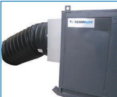
Product: ? Description: 28" Sheet Metal Square to Round Transition