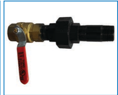
Product: N/A Description: 1/2", 3/4" or 1" Typical Ball Valve Assembly; Fuel Service Shut Off Valve (Specific To Sizing)