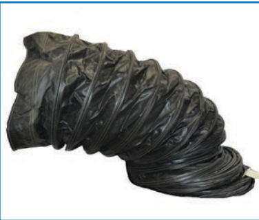
Product: 84600.186 (28" x 25') Description: 28" x 75' Maximum Length High Temperature Duct Poly Vinyl Black From Heater Discharge. Longer runs can be used with increased HP - contact your TA rep for calculations