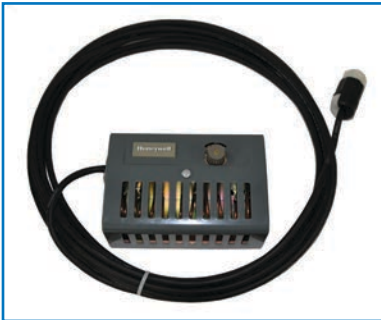
Product: R50619.100 Description: Thermostat Package