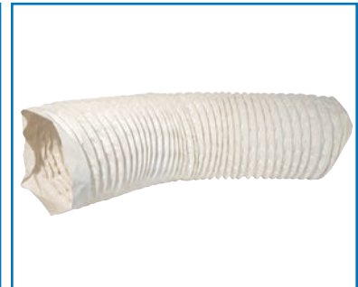
Product: R84600.019 (20" x 15') R84600.015 (20" x 25') Description: 20" x 100' Maximum Length Duct Poly Vinyl White From Bullnose