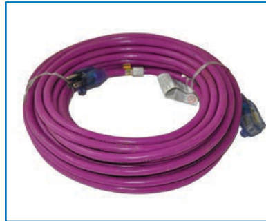
Product: R82900.420 Description: Extension Cord 50' 12/3