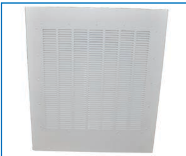
Product: R52180.042 Description: 20" Air Square Return