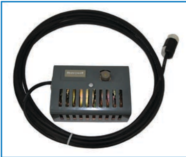
Product: R50619.100 Description: Thermostat Package