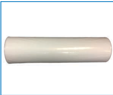
Product: 84600.021 Description: 20" Duct Add Poly W/ Holes - 32" Flat Clear, 3" Hole/60" (500')