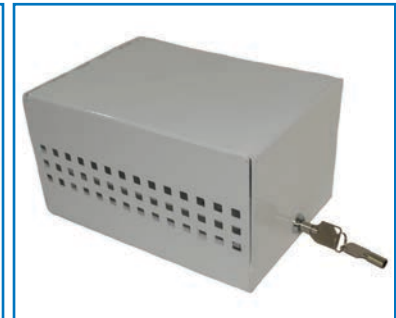
Product: R87800.041 Description: Thermostat Lock Box