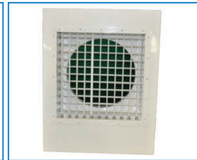
Product: R52180.041 Description: 20" Air Supply Square