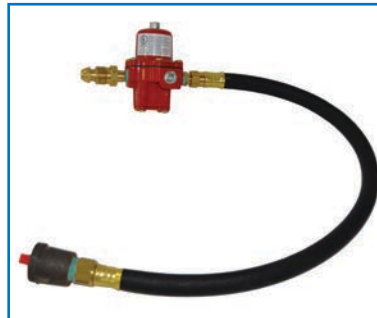
Product: R86200.190 Description: 1st Stage Regulator For Propane Tanks