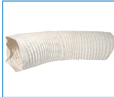
Product: R84600.019 (20" x 15') R84600.015 (20" x 25') Description: 20" x 150' Maximum Length Duct Poly Vinyl White From Heater Discharge