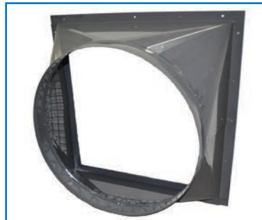
Product: 250.0020.120 Description: Transition With One Collar for 20" Duct