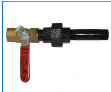
Product: N/A (Included w/ Heater) Description: 1/2", 3/4" or 1" Typical Ball Valve Assembly; Fuel Service Shut Off Valve (Specific To Sizing)