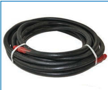
Product: HS50x1/2 or HS50x3/4 or HS50x1 Description: 50' by 1/2", 3/4" or 1" Gas Hose (Any Combination Specific To Sizing) Propane or natural gas