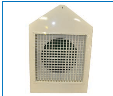
Product: R52180.040 Description: 20" Air Supply Vee Louver