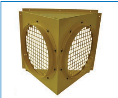
Product: R65502.027 Description: Bullnose Transition With Two Collars for 14" Duct