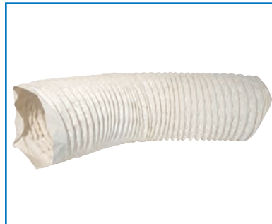
Product: R84600.018 (14" x 15') R84600.164 (14" x 25') Description: 14" x 150' Maximum Length Duct Poly Vinyl White From Bullnose