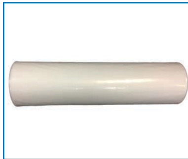
Product: 84600.210 Description: 20" Add Plastic Interior or Duct W/O Holes - 200F Max Temp - 335F Melting Temp